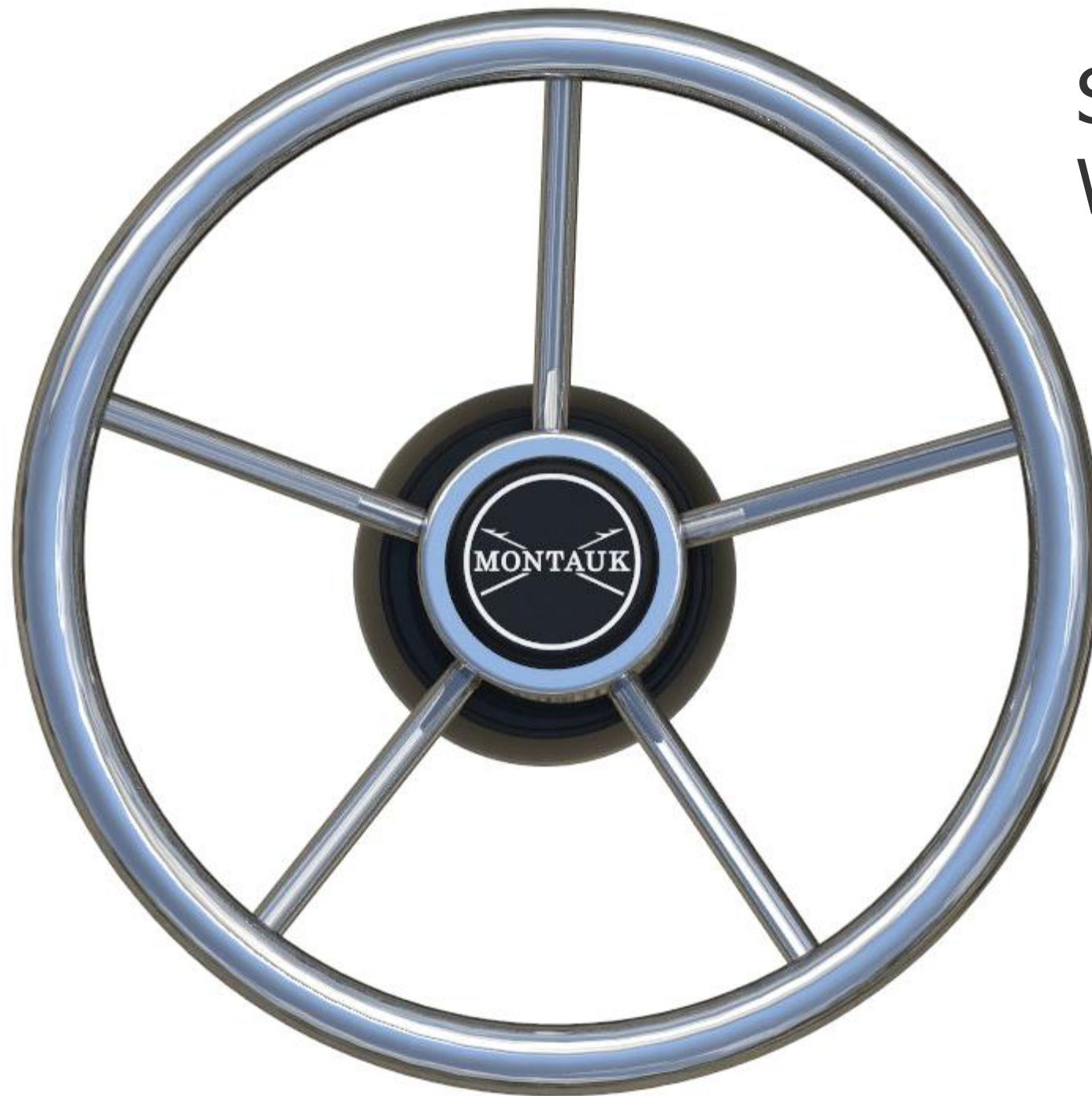
Steering Wheel Logo